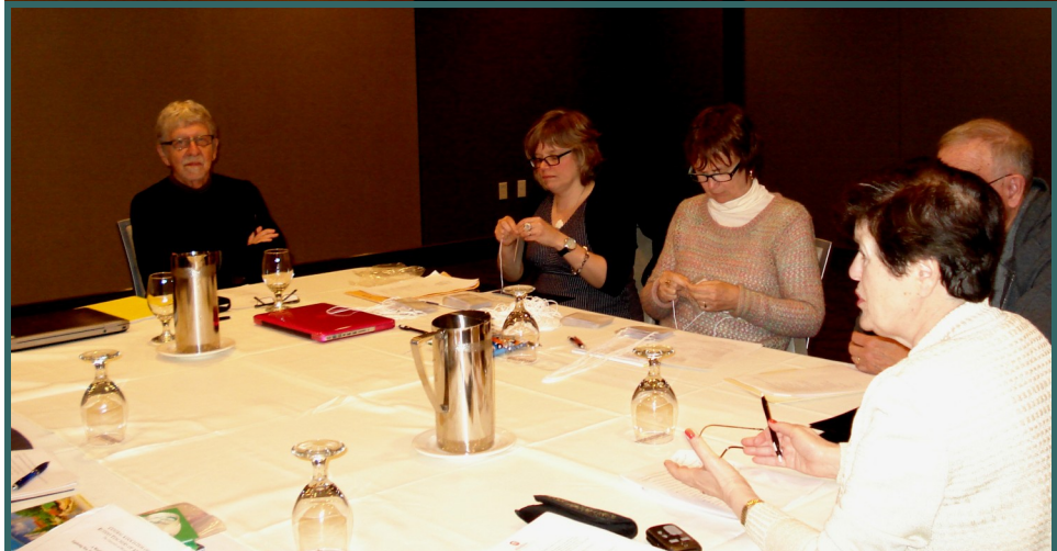
CARTA Board multi-tasks: conducts business and prepares name tags