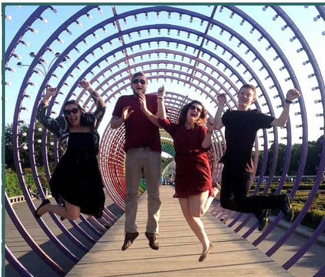
(left) ECU students' celebratory jump "because we made it to Russia" (right) Group pose in Moscow