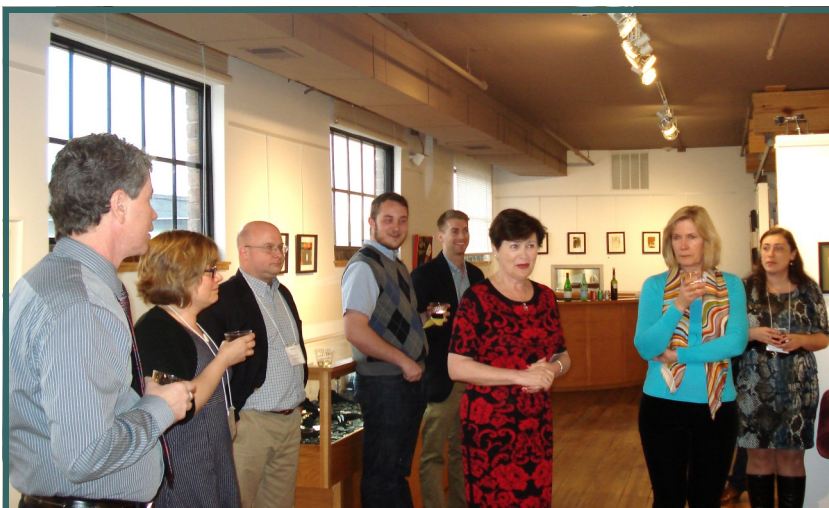
CARTA opening reception at PS Gallery in Columbia

hotel administration gave everybody a round of free drinks that we enjoyed and that helped to cope with calamities of the weather as well as